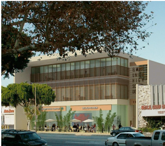
New District Office (Projected)