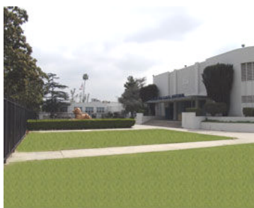
El Monte High School