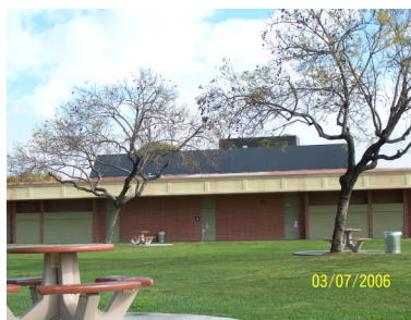
Mountain View High School