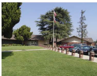
Arroyo High School