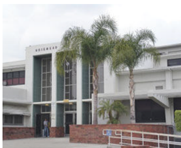
Rosemead High School