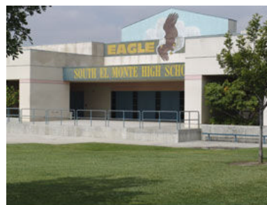
South El Monte High School